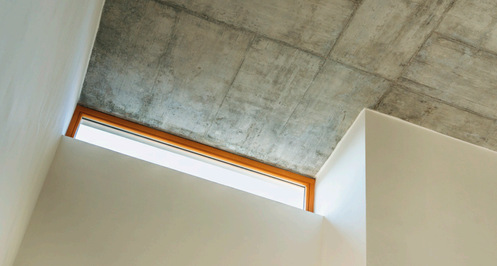
Degradation of NO on the surface of concrete